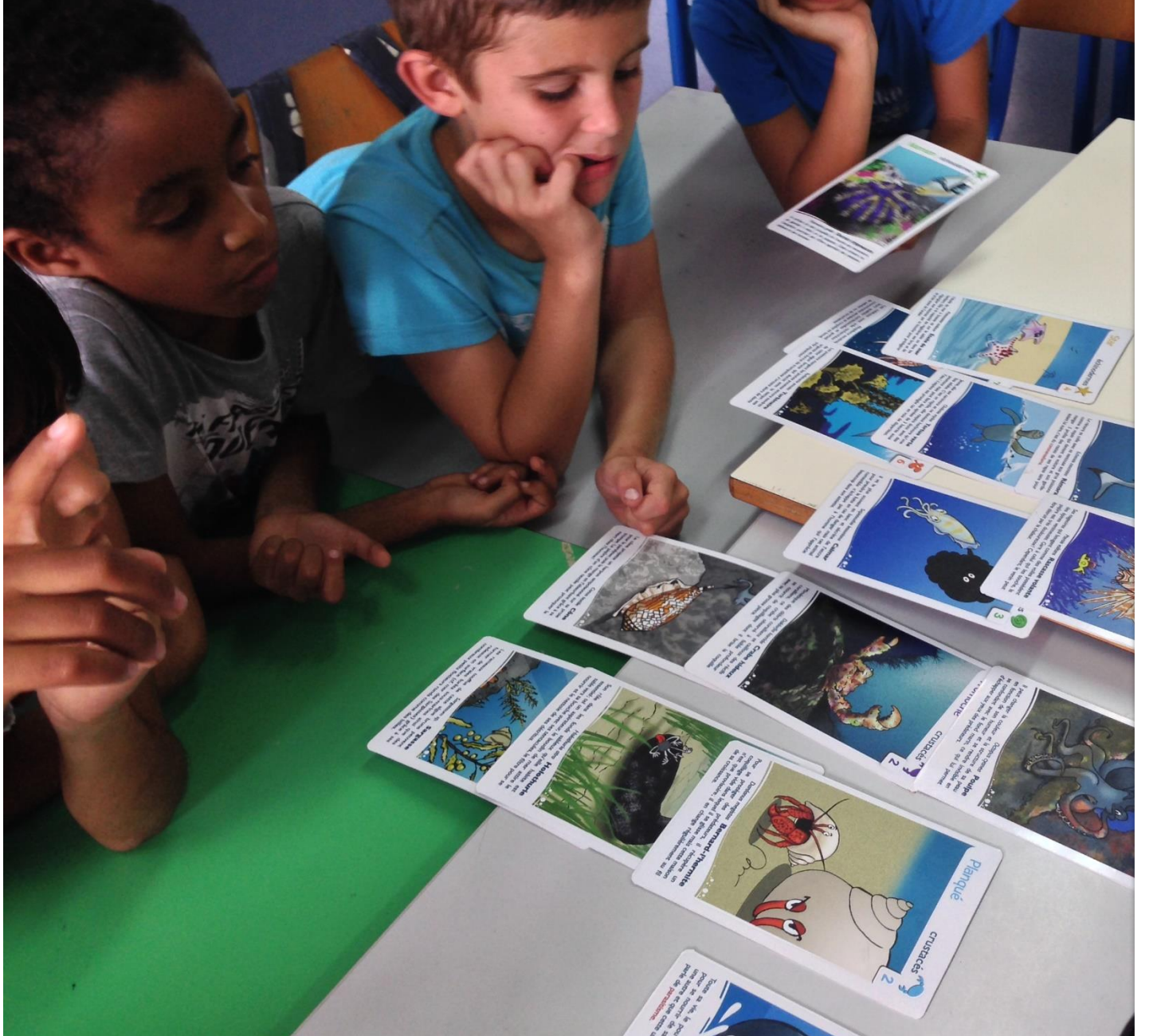
Reunion Island, 2015