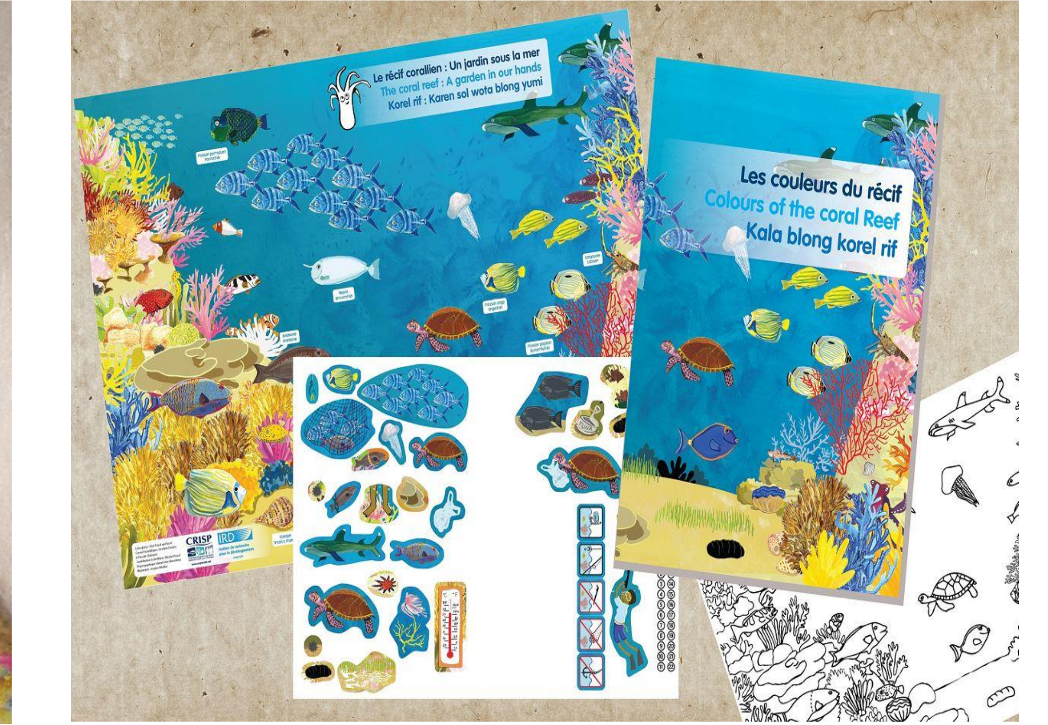
The picture book « The Colours of the Reef »